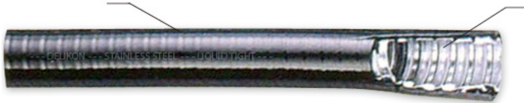
Stainless Steel Liquid Tight Conduit

STAINLESS STEEL STRIP HELICALLY WOUND WITH NYLON SEALING CORD